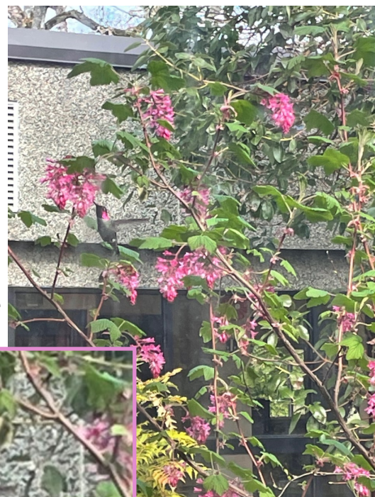
Hummingbird in our Indigenous Courtyard