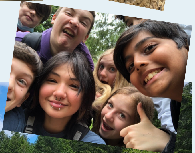
Grade 6 and 7's at Mt. Doug Park