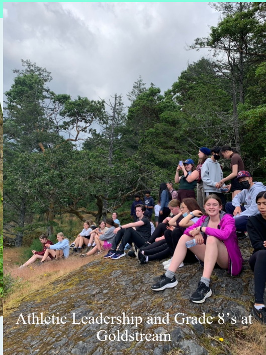
Athletic Leadership and Grade 8's at Goldstream