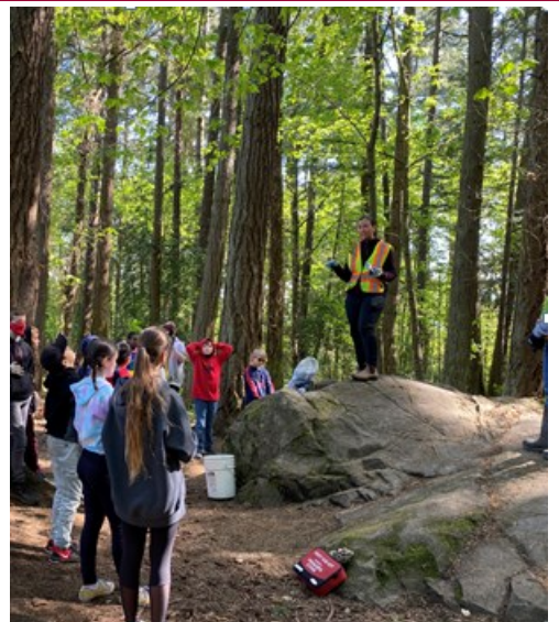
One of our Global Action Exploratory groups in action at Haro Woods

Change is a natural, expected part of life. But that doesn't mean it's easy. While some people thrive on change, most experience some level of discomfort around transitions. And some people really struggle when adjusting to a new situation. For teens, change can be particularly difficult.