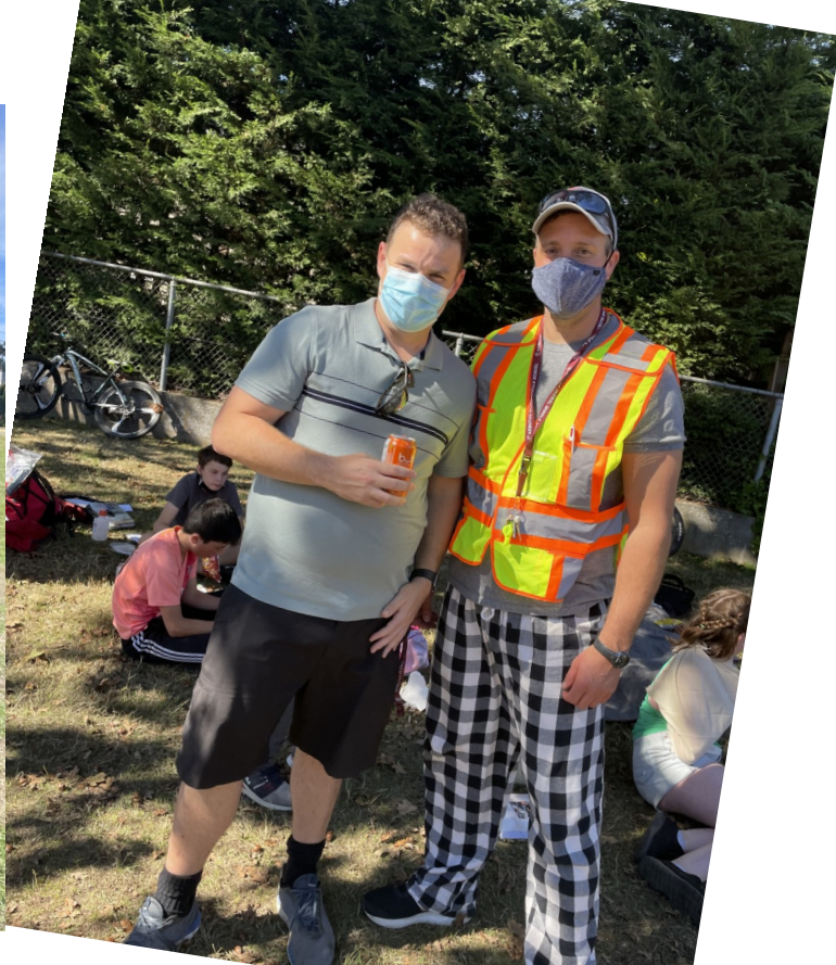
The winners of our “injured and missing students” receiving treatment in our medical area.