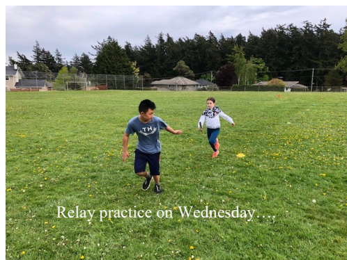
Relay practice on Wednesday...

Your PAC is desperately in need of new executive for the next school year . Please email agms.pac@gmail.com if you would like to know more.