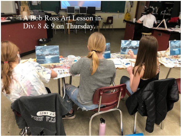
A Bob Ross Art Lesson in Div. 8 & 9 on Thursday.