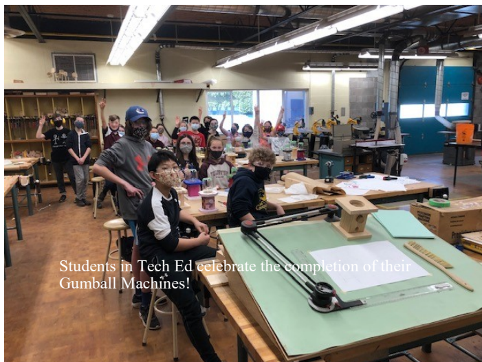
Students in Tech Ed celebrate the completion of their Gumball Machines!

For more information about the Educational Assistant Training Program, including program content and requirements for acceptance into the program, visit the School District 61 website at www.sd61.bc.ca and go to Employment .