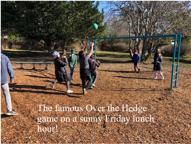
The famous Over the Hedge game on a sunny Friday lunch hour!

New PAC Facebook Page: Please feel welcome to join the Arbutus parent community, any time, by joining the Arbutus Global Middle School parent portal on Facebook, supported by the AGMS PAC. facebook.com/groups/agmspac . This group is now up to 70 parents but more are always welcome!