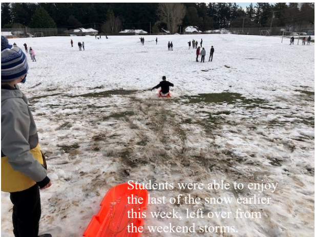
Students were able to enjoy the last of the snow earlier this week, left over from the weekend storms.

Volleyball: I was sorry to have to stop after school volleyball this week due to new guidelines from the Middle School Sports Association, but feel it is the safe thing to do at this time. We hope to start Track and Field outdoors after Spring Break, which should be a safer sport to implement.