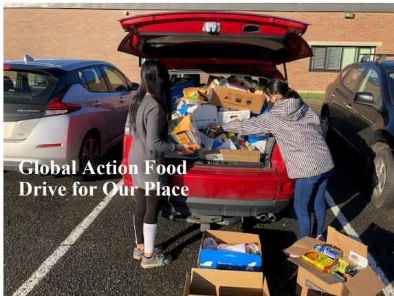
Global Action Food Drive for Our Place

Have a wonderful, relaxing, safe and healthy holiday break!