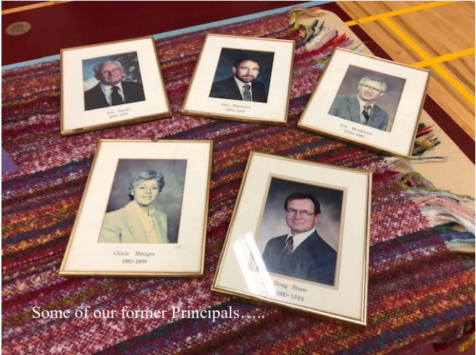
Some of our former Principals.....