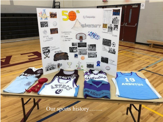
Our sports history.....