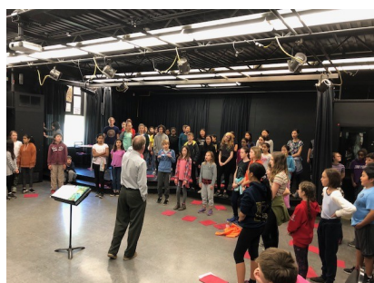
Our AGMS Choir in action early Wednesday morning.

Arbutus Global: Celebrating diversity; Seeking sustainability