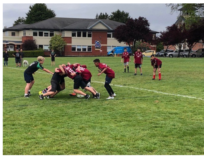
Grade 7/8 Boys Jamboree on Tuesday.....