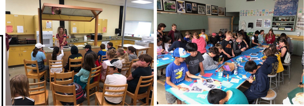
Grade 5 begin their transition to middle school with a visit on Thursday.