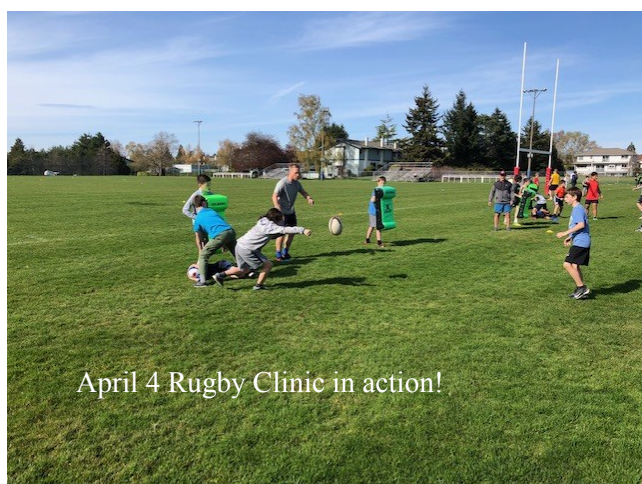
April 4 Rugby Clinic in action!