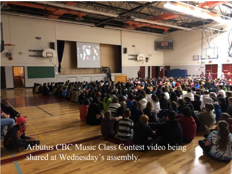
Arbutus CBC Music Class Contest video being shared at Wednesday's assembly.