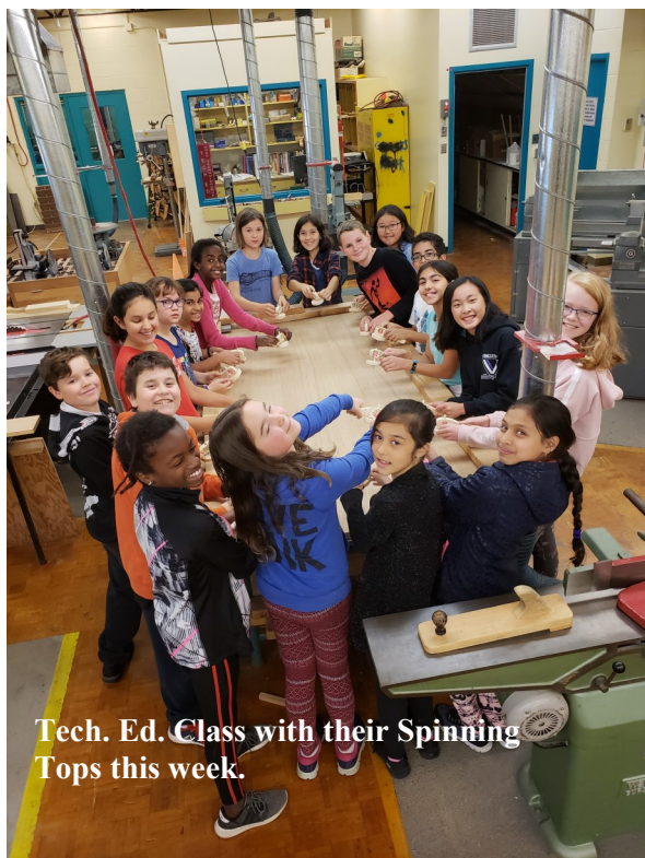
Tech. Ed. Class with their Spinning Tops this week.