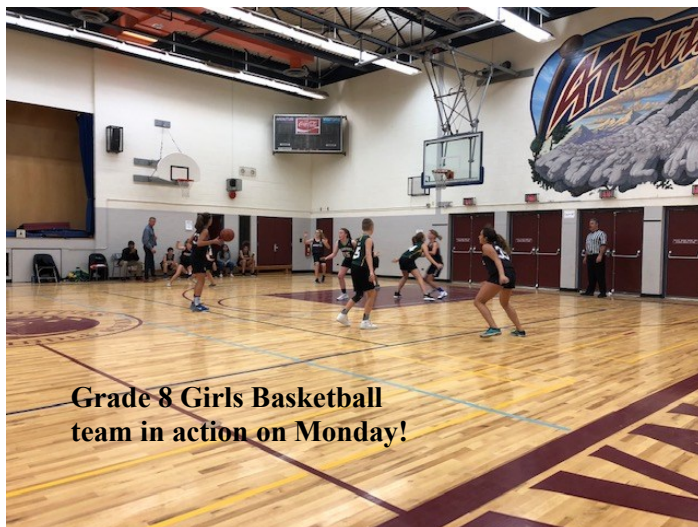
Grade 8 Girls Basketball team in action on Monday!