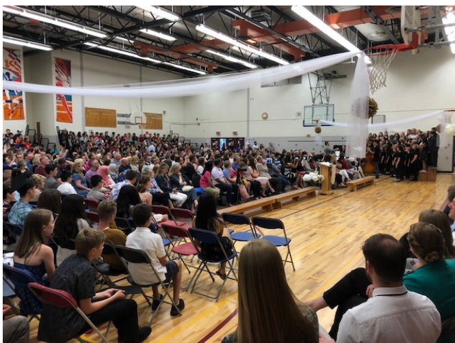
Grade 8 Recognition Ceremony on Monday - All the best to our Grade 8s in high school!