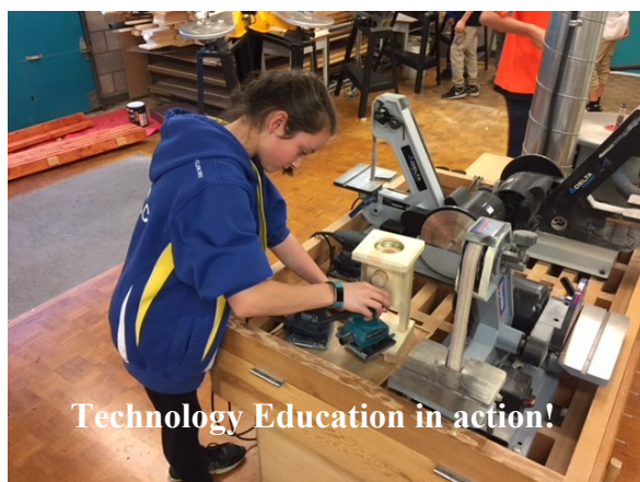
Technology Education in action!

Poinsettia Concerts: The Arbutus Poinsettia Concerts will be taking place at 7 pm on November 29 and 30 in our school gymnasium. All Arbutus Music ensembles will be performing at this event. Please see the attached "November Music Update" PDF for information on student arrival times, performance nights, fundraising, participation and uniforms.