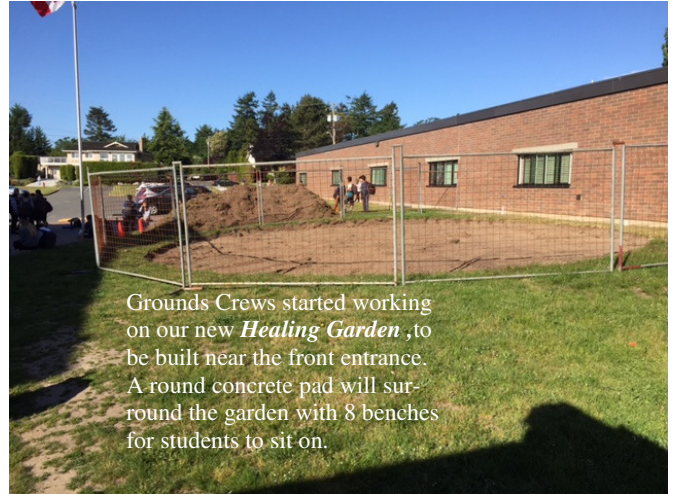
Grounds Crews started working on our new Healing Garden , to be built near the front entrance. A round concrete pad will surround the garden with 8 benches for students to sit on.