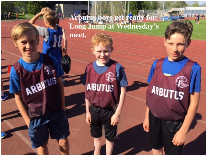
Arbutus boys get ready for Long Jump at Wednesday's meet.