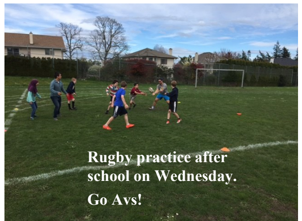
Rugby practice after school on Wednesday. Go Avs!