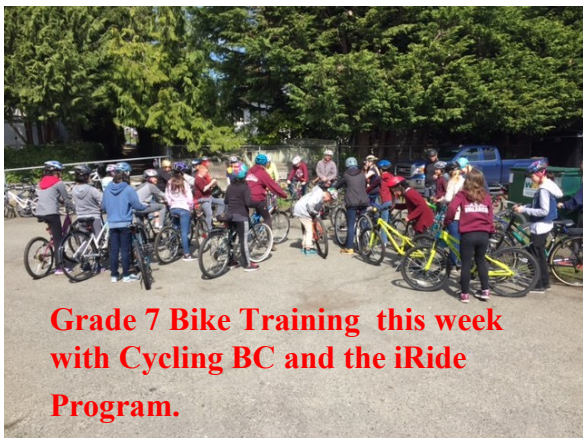
Grade 7 Bike Training this week with Cycling BC and the iRide Program.