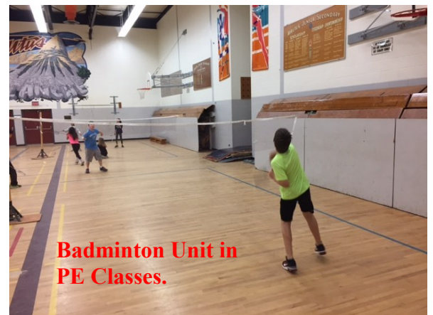
Badminton Unit in PE Classes.

Attendance - Please email attendance62@sd61.bc.ca or phone 250-360-0725 and leave a message with your child's name, homeroom teacher and date/time of absence. Thank you