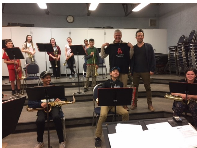
Superintendent visits Summit Jazz!