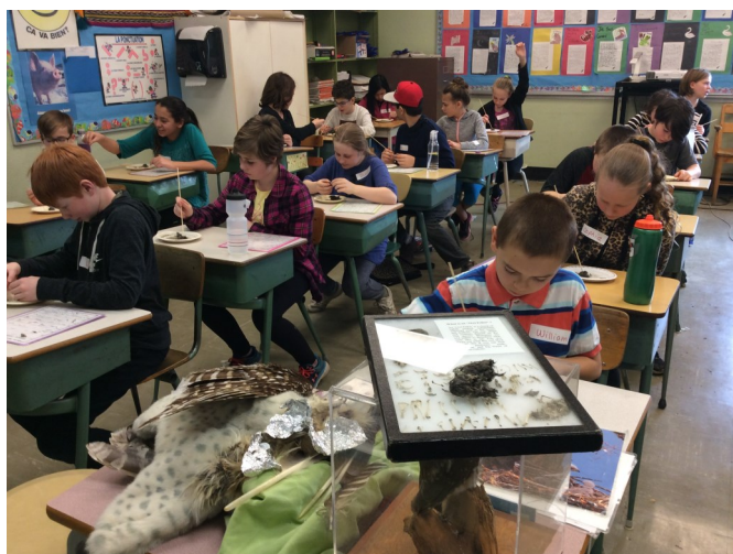
Swan Lake Nature Program on Owls in Div. 11