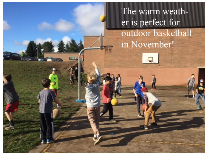
The warm weather is perfect for outdoor basketball in November!