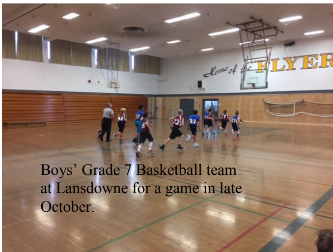
Boys' Grade 7 Basketball team at Lansdowne for a game in late October.

Parent Education Night November 23 The AGMS PAC and Mt. Doug PAC are hosting an information evening on Student Mental Health and Wellness at Mt. Douglas Secondary on Wednesday, November 23 at 7 pm . A panel will be addressing how to support children with mental health needs, and possible resources that can be accessed in our community. All Arbutus parents are invited to join us.