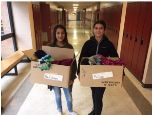
Global Action students collecting clothes for the Clothes Drive this week.

Attendance - Please remember to inform the office if your child will be late or absent. You can email to attendance62@sd61.bc.ca or phone and leave a message on our call back line at 250-360-0725 .