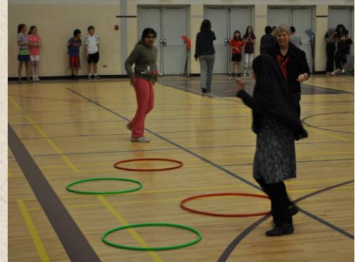
Student Olympics put on by Uvic Students

Tickets can be purchased at the UVic Auditorium box office. For more information, see www.arbutusmusic.ca